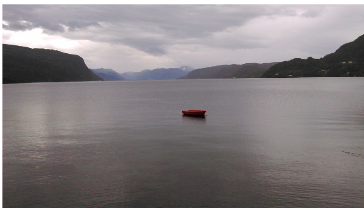
View from Bergen