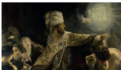
Rembrandt. "Belshazzar's Feast,"